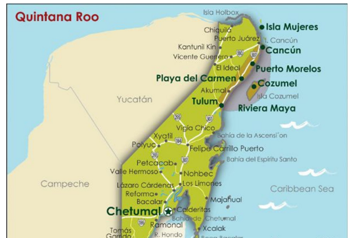
Figure 1: Polyuc, Felipe Carrillo Puerto, Quintana Roo, Mexico.

In the period from June 3, 2019 to July 12, 2020, 136 students from the “Miguel Hidalgo y Costilla” Elementary School located in the Polyuc community of the Maya municipality of Felipe Carrillo Puerto, Quintana Roo, Mexico, were evaluated.